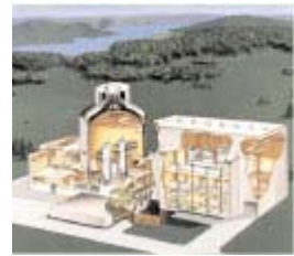
The Evolution of Commercial Nuclear Power Plants

The heart of a nuclear power plant is the reactor, in which a core of fissile materials generates heat in controlled fission reactions. A liquid or gas coolant extracts the heat, which drives a turbine to produce electricity. Most nuclear power plants today are fueled by uranium that has been enriched slightly in the isotope ^{235}\text{U} , which fissions more readily than the more abundant isotope ^{238}\text{U} . In these modern reactors, neutrons are "moderated"--that is, slowed down--to drive the fission process. Because moderation brings the neutrons to thermal equilibrium with the environment, such reactors are known as thermal reactors.